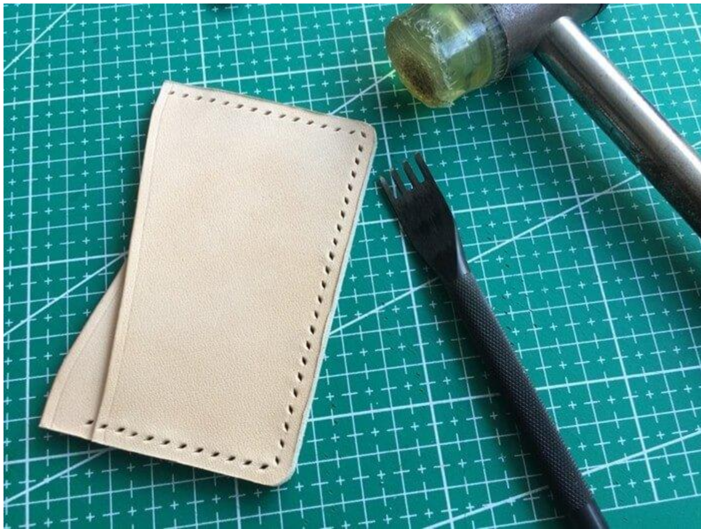
Punch stitcing holes by following the lines.