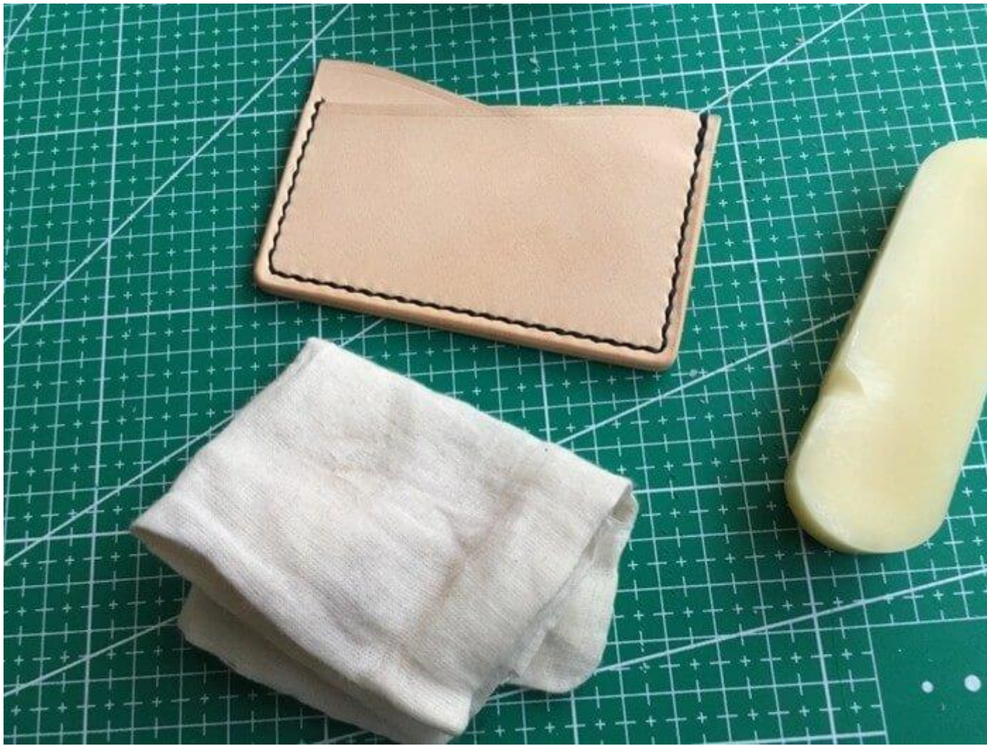
Burnishing the edge.