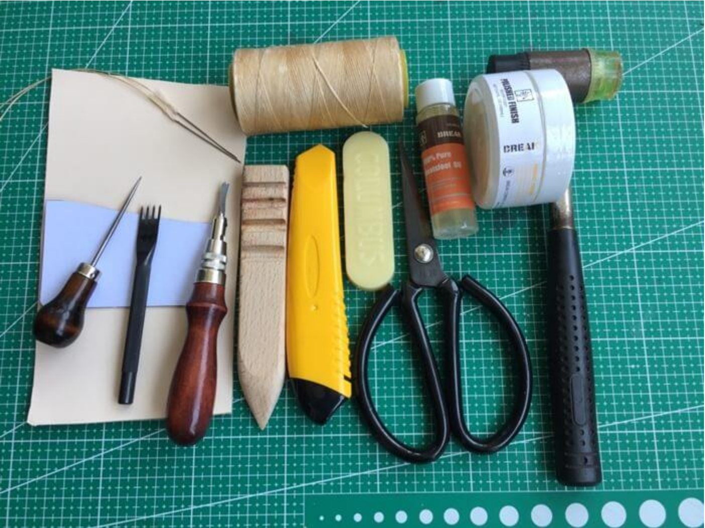
Tools and supplies to make this leather card holder.