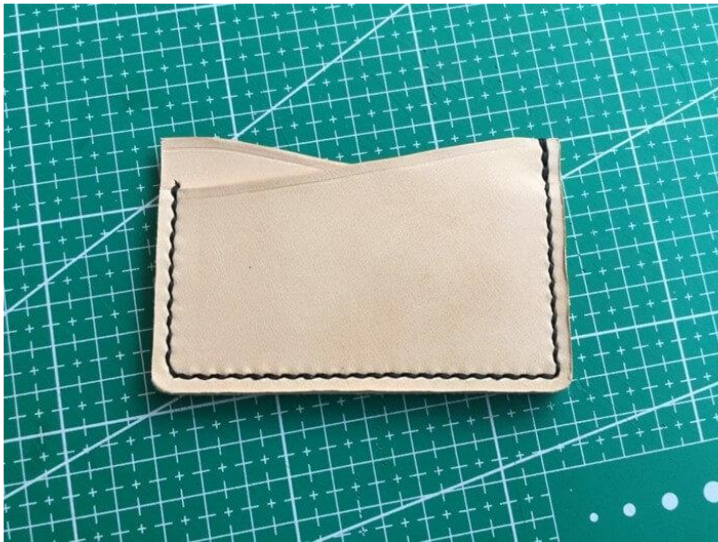
Sewing with saddle stitching method.