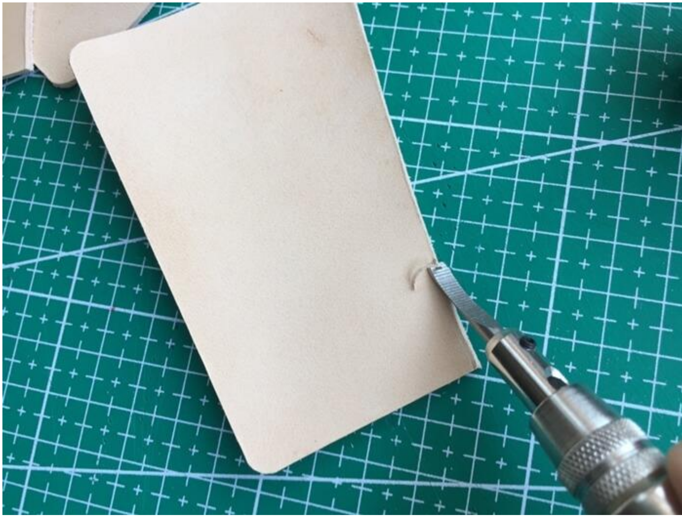
Trimming the top edges of the flaps with an edge beveler.